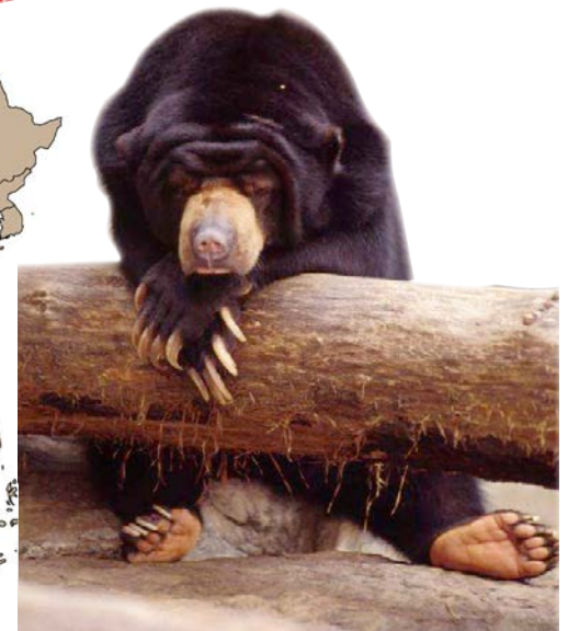
Sun bears are excellent climbers.