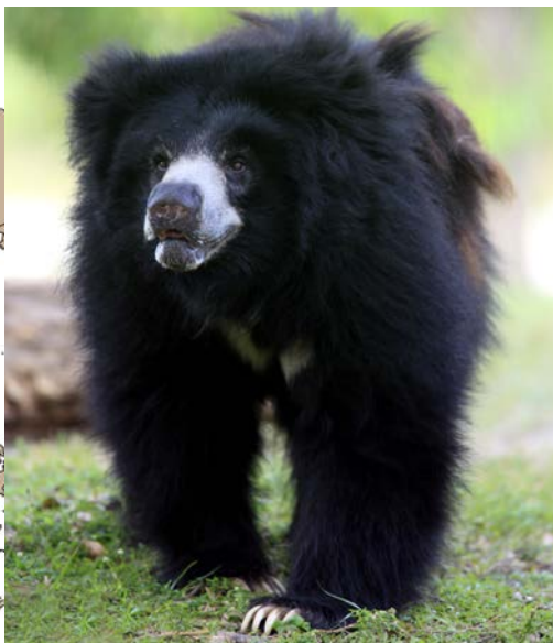
Sloth bears can close their nostrils to better suck up termites.