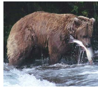
Brown bears love salmon.

Brown bears have the largest range of any kind of bear. They live in western North America, parts of Europe, and much of northern Asia. Brown bears vary in size depending on where they live and what they eat. Fish, especially salmon, is a staple in the diet of many brown