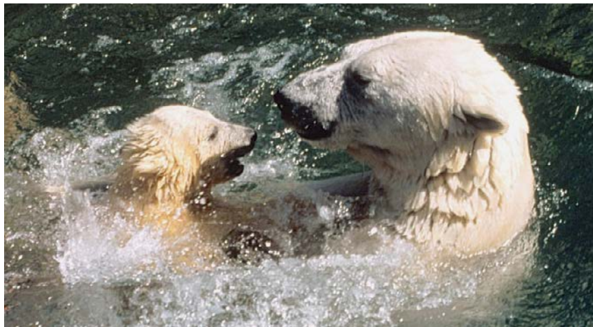
Bear mothers are extremely attentive and caring.