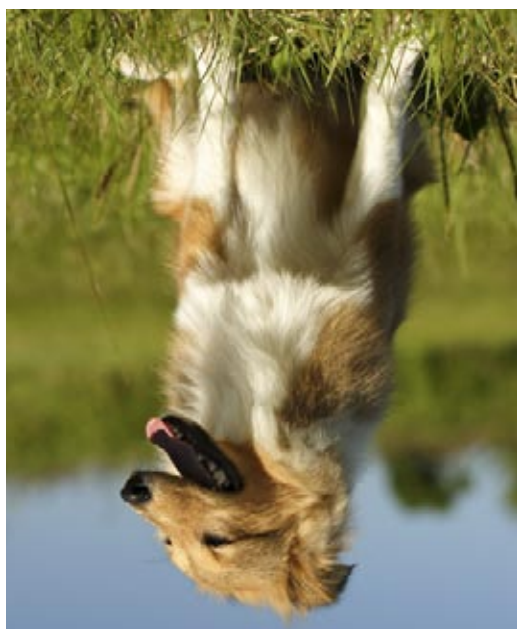
Photo Credits: Front cover: Amanda Rohde/iStockphoto; back cover: George Clerk/iStockphoto; title page: © Balduur Trygvason/iStockphoto; page 3: © Andrei Baroni/iStockphoto; page 4: Dragon Tiffunovic/iStockphoto; pages 5, 7, 8, 10, 12: © iStockphoto; page 6: © John Rich/iStockphoto; page 9: © Jim Larson/iStockphoto; page 11: © Aneken Nihatehko/iStockphoto